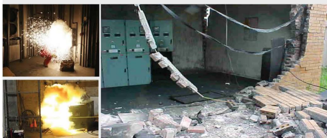
The likelihood of a shock exposure and arcing fault and arc flash increase when equipment is designed, installed, operated, or maintained improperly

Awareness ensures there is a plan and it has considered all the potential risks of doing energized open-panel CBM work. Until the plan is complete and documented, you cannot proceed to the next